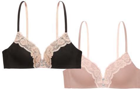
600-GG-00073 WIRE-FREE MOULDED SOFT BRA Organic cotton with recycled trim