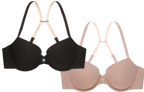
600-GG-00072 TWO-WAY T-SHIRT BRA Organic cotton