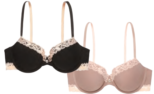
600-GG-00074 T-SHIRT BRA Organic cotton with recycled trim