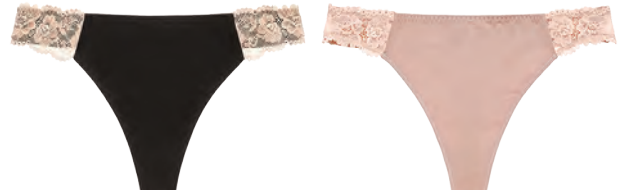
600-GG-00080 STRING Organic cotton with recycled trim