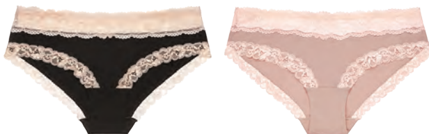
600-GG-00077 HIPSTER Organic cotton with recycled trim