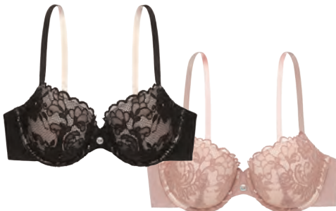
600-GG-00075 T-SHIRT BRA Organic cotton with recycled anemone/jewelvine lace