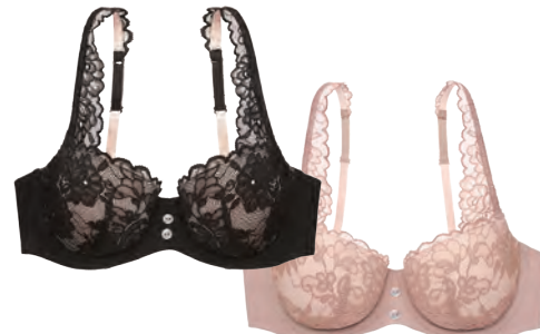
600-GG-00076 BALCONY BRA Organic cotton with recycled anemone/jewelvine lace