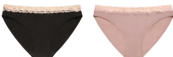
600-GG-00079 BRIEF Organic cotton with recycled trim