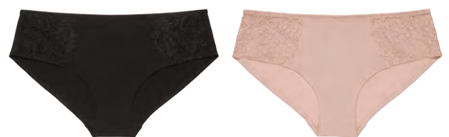
600-GG-00078 HIPSTER Organic cotton with recycled anemone/jewelvine lace