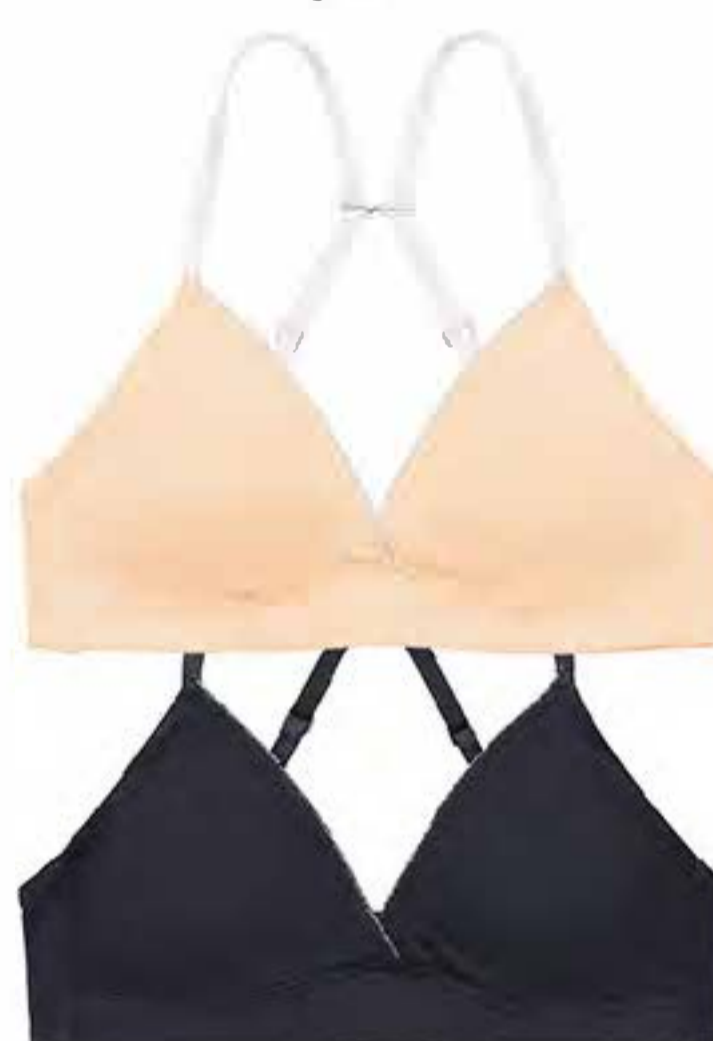
600-FF-00133 TWO-WAY SOFT BRALETTE *removable pads Comfy modal