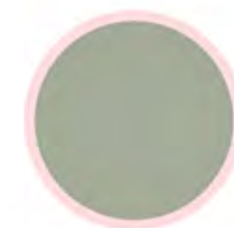
ASH GREEN 16-0110TCX