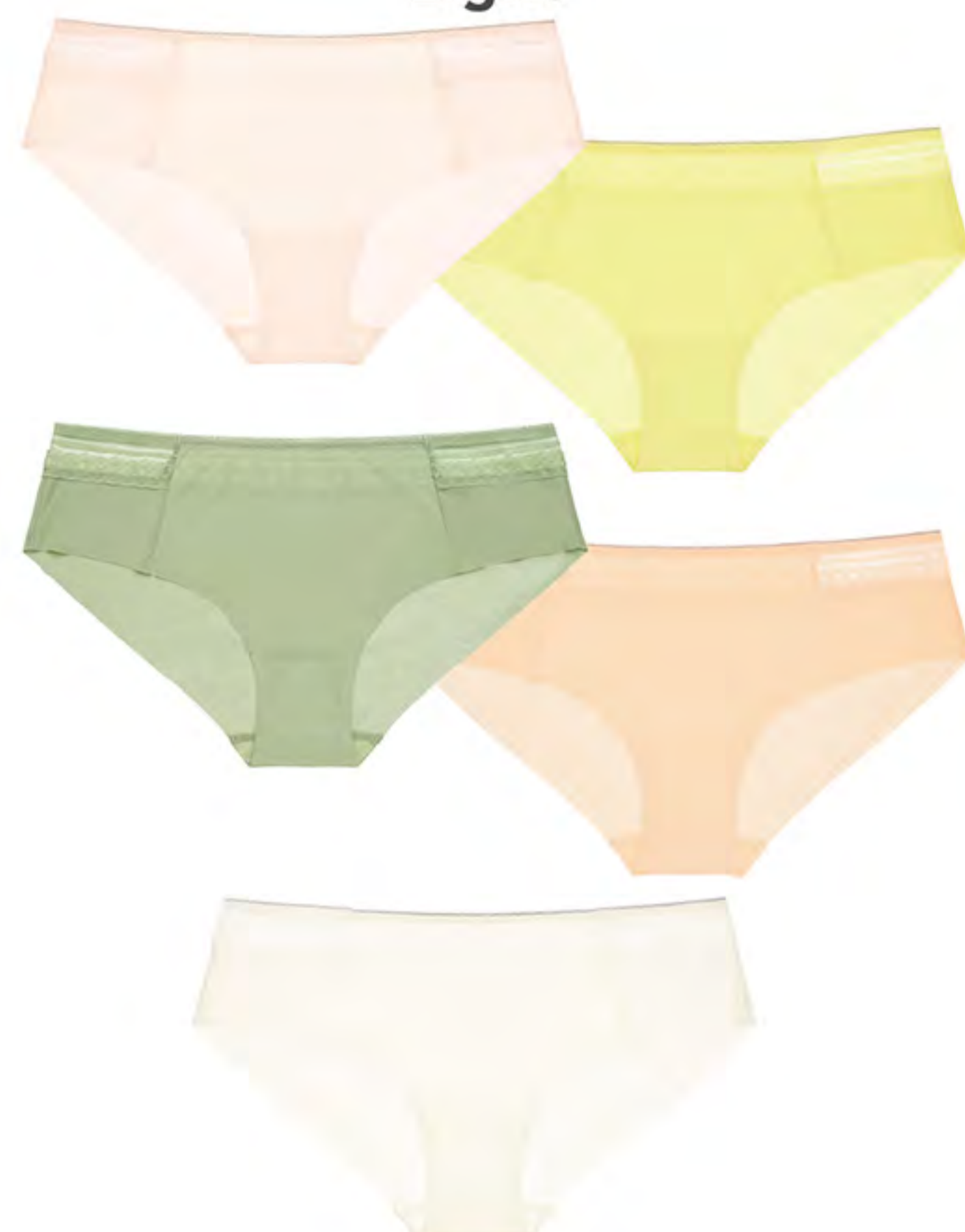
600-FF-00141 HIPSTER Comfy free cut modal with lace trim