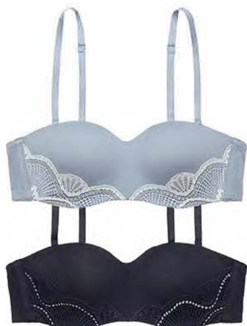
600-FF-00131 TWO-WAY ONE-PIECE BANDEAU BRA Comfy modal with lurex motif floral lace