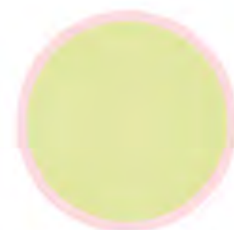
LOVELY LIME 12-0525TCX