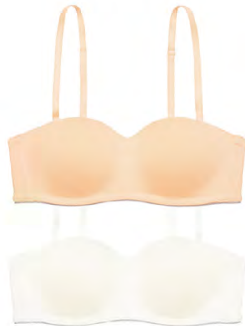
600-FF-00138 TWO-WAY ONE-PIECE BANDEAU BRA Comfy modal