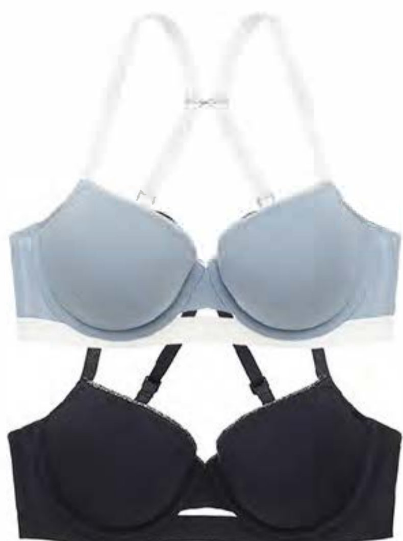
600-FF-00125 TWO-WAY T-SHIRT BRA Comfy modal