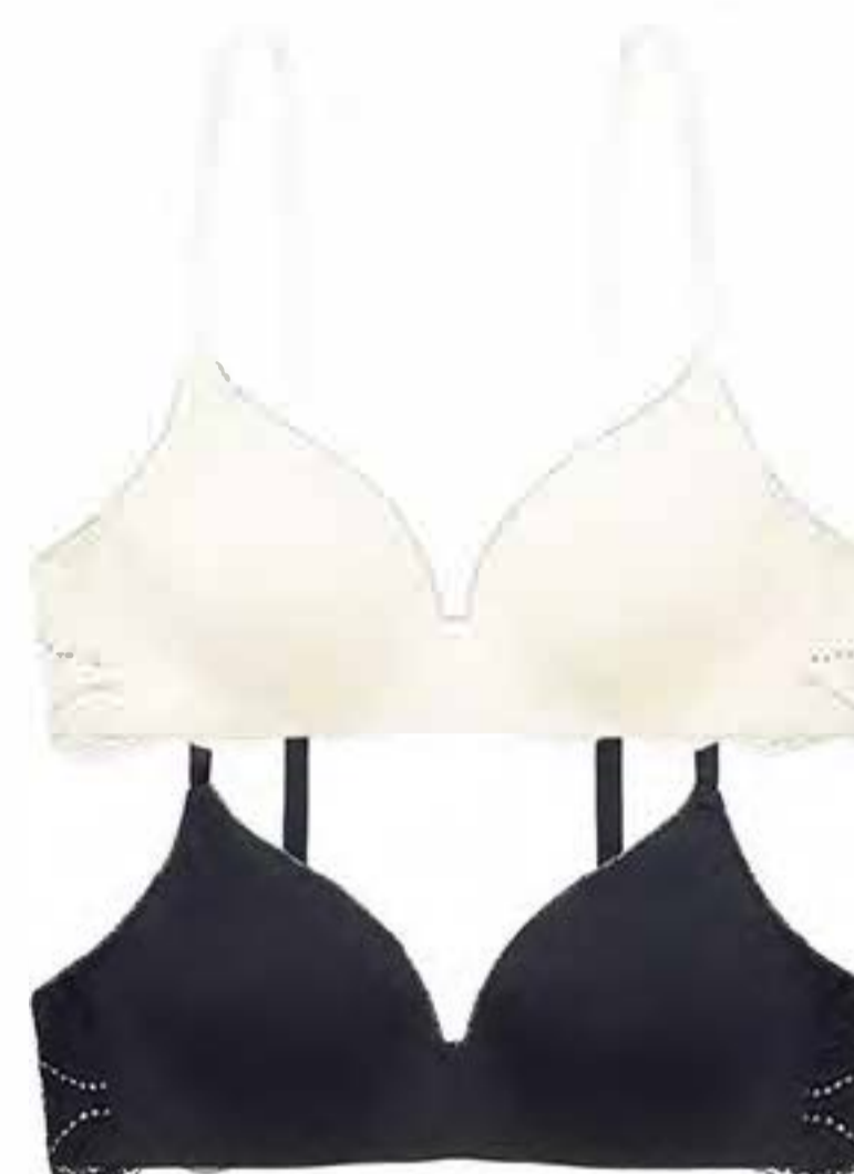
600-FF-00129 WIRE-FREE MOULDED SOFT BRA Comfy modal with lurex motif floral lace