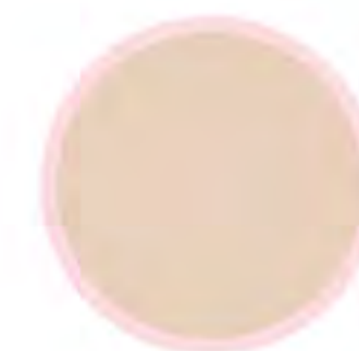
NUDE ROSE 12-1007TCX

Discover our refreshing take on a pastel palette. Pretty, playful details and smooth-finish, soft-touch fabrics make this a core basics collection to wear every day and everywhere.