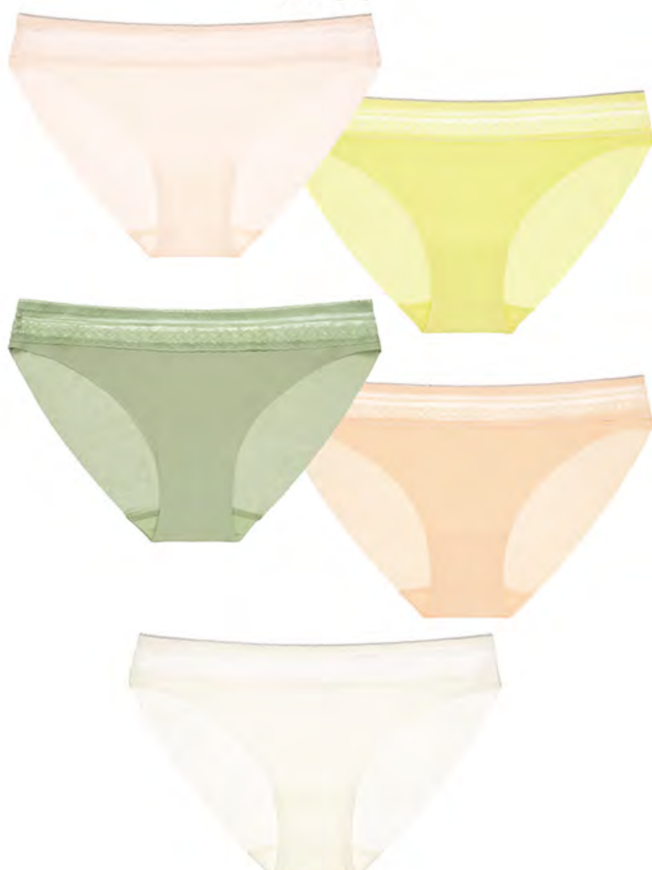
600-FF-00140 BRIEF Comfy free cut modal with lace trim