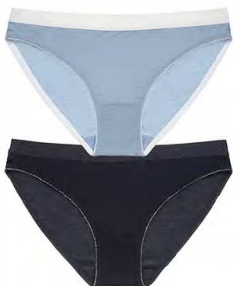
600-FF-00126 BRIEF Comfy modal