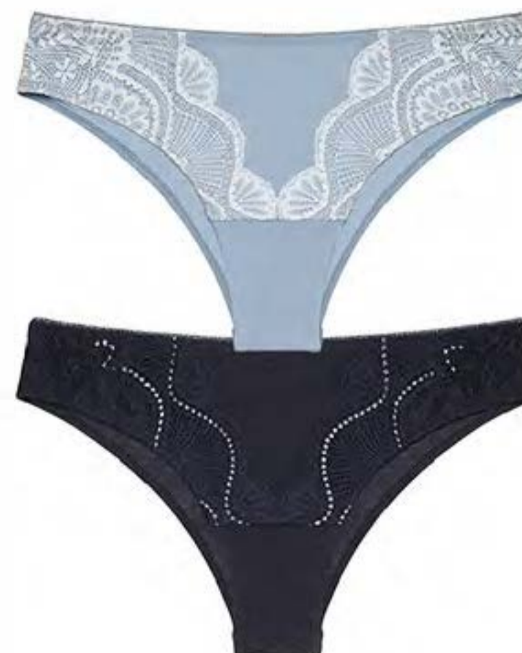
600-FF-00132 BRAZILIAN Comfy modal with lurex motif floral lace