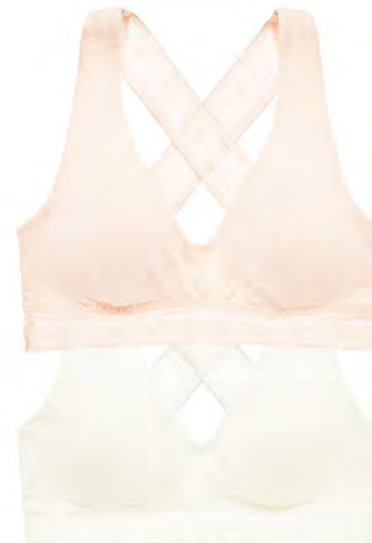
600-FF-00139 SOFT BRALETTE *removable pads Comfy modal with lace trim