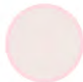
PEONY PINK 11-2409TCX