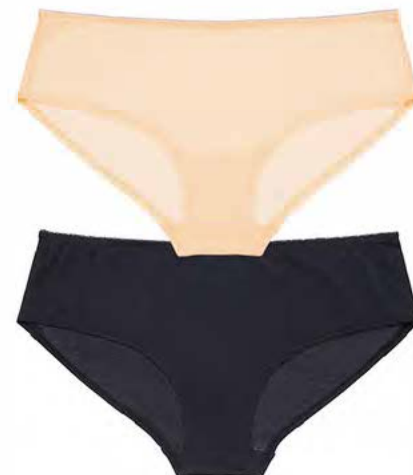
600-FF-00134 HIPSTER Comfy modal