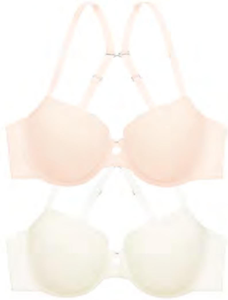
600-FF-00135 TWO-WAY T-SHIRT BRA Comfy modal