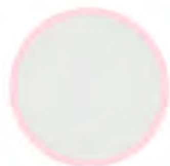
PEARL WHITE 11-4800TCX

Here, spring shades get a contemporary update, resulting in clean, invigorating designs that are soft to touch and feel fluid on the body.