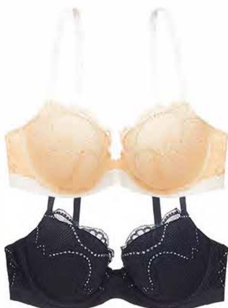
600-FF-00127 PUSH-UP BRA Comfy modal with lurex motif floral lace