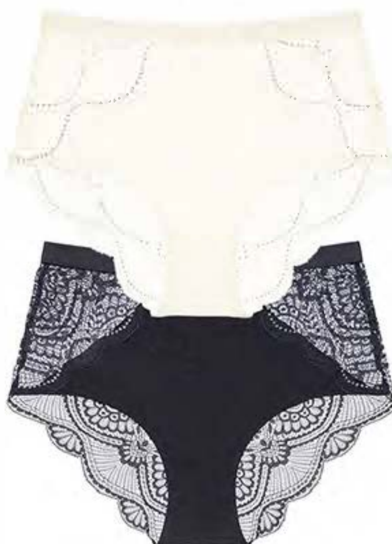
600-FF-00130 HIGH-WAISTED HIPSTER Comfy modal with lurex motif floral lace