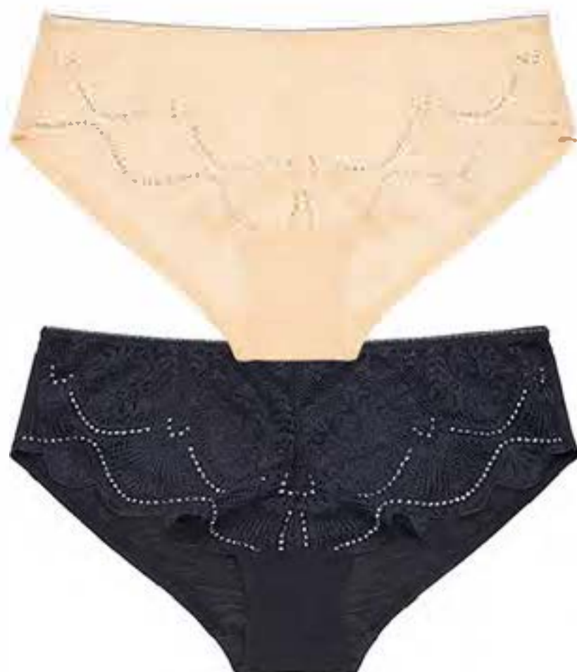
600-FF-00128 HIPSTER Comfy modal with lurex motif floral lace