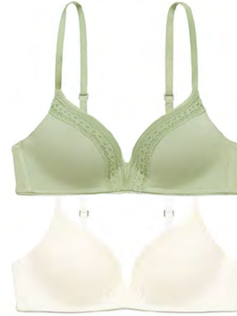
600-FF-00137 WIRE-FREE MOULDED SOFT BRA Comfy modal with lace trim