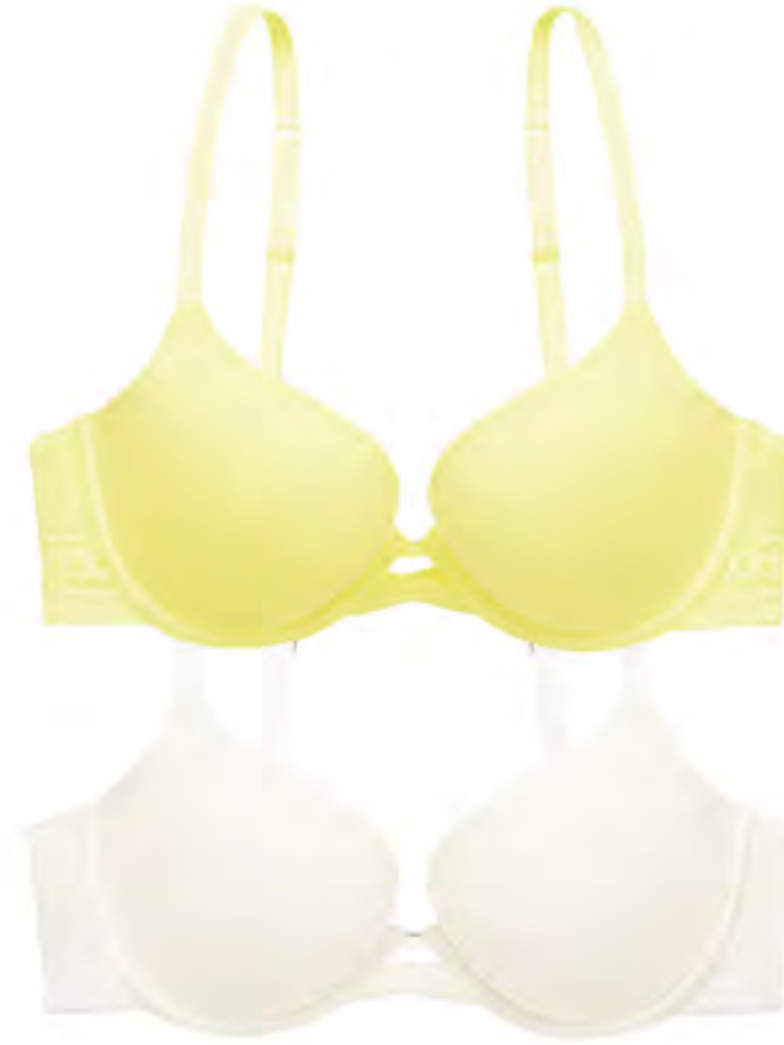
600-FF-00136 PUSH-UP BRA Comfy modal with lace trim